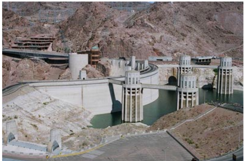
Hoover Dam - This is an amazing sight.