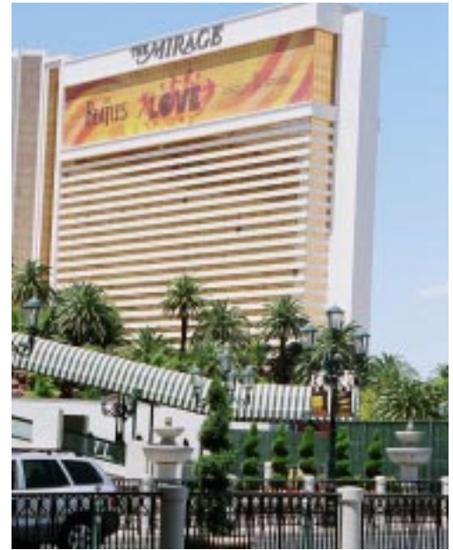
Mirage Hotel- where I bought Becky a Beatles T-Shirt for $50