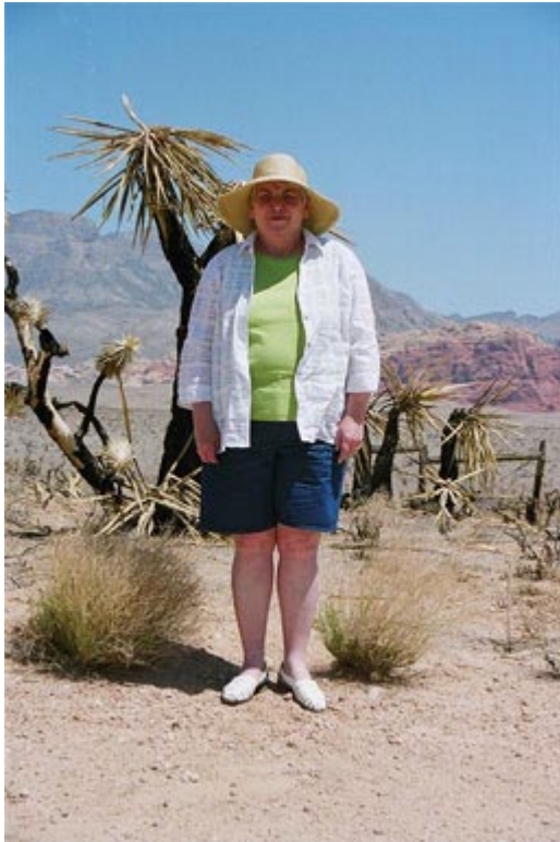
Here I am at Red Rock Canyon. I call this photo - "The Anti Tourist"