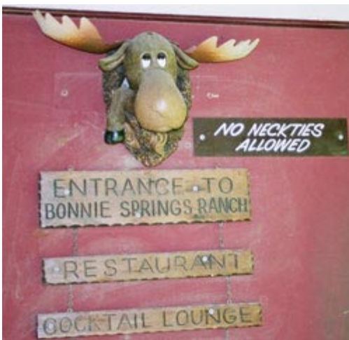
The only moose you will see in Las Vegas at Bonnie Springs