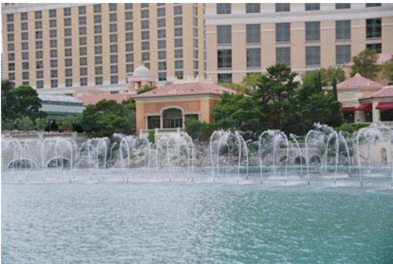
Water Show at the Bellagio Hotel on the strip.